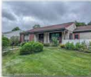
Wheaton Model Currently $258,900