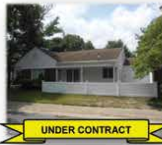
Blair Model Pending