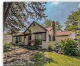
Stratford Model Currently $248,900