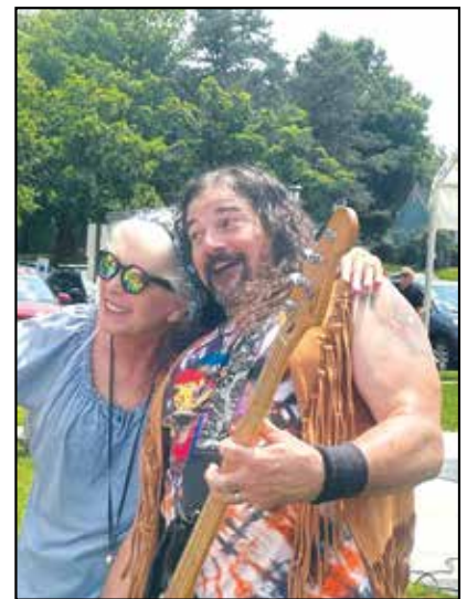
Photos of Bocce Woodstock Picnic