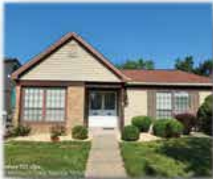
Stratford Model Currently $228,000

Ridge Realty is a Full-Service Agency that specializes in Adult Community Resales. We offer personalized service and extensive knowledge of Ocean & Monmouth Counties to meet the needs of both Buyers & Sellers. If you are thinking of selling your home and would like to know what it's worth in today's market, please call 732-323-9007 today!