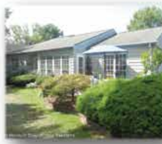
St. Tropez Model Currently $299,900