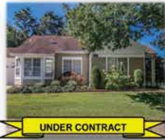
Ritz Model Pending