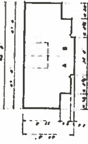
FRONT OF BLDG TYPE R2-2

4/22/17 Leisure Technology Northeast, Inc.