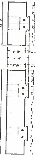
FRONT OF BLDG TYPE C2-2