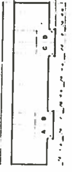
FRONT OF BLDG TYPE C4-2