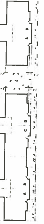
FRONT OF BLDG TYPE W2-2