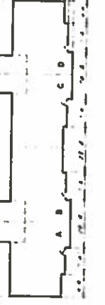
FRONT OF BLDG TYPE W4-2